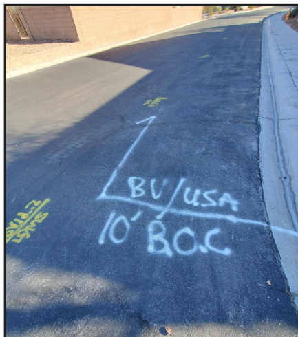
White marks the location of a planned excavation on this Las Vegas street. Yellow marks the location of a gas pipeline.

The NRCGA's excavator appreciation events typically feature a dinner or breakfast, short presentations from damage prevention experts, and an award ceremony to present one