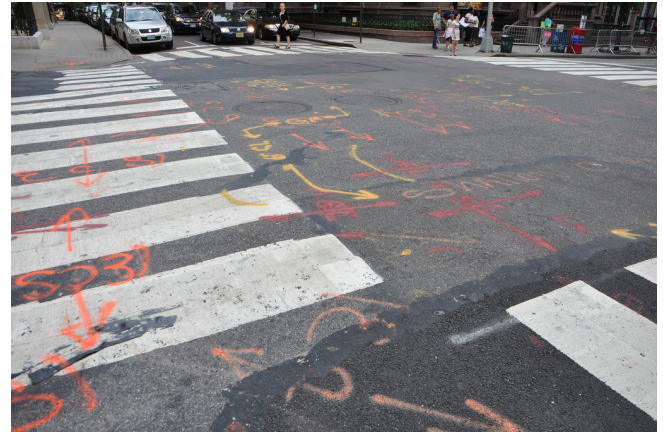
The image at left depicts the colors used by utility line locators to mark the location of buried utility lines. The image at right shows a city intersection that has had its buried utility lines marked for a future excavation.