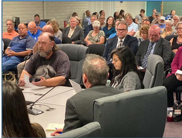
A consumer, at left, provides comments at a June 2024 consumer session at the PUCN's Carson City office regarding NV Energy's request to change gas and electric rates in Northern Nevada.

as well as some telecommunication, railroad and water companies. The record from the consumer sessions is provided to the Legislature.