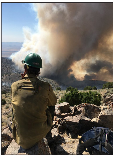
Limerick Fire, 15 miles northeast of Lovelock, NV. The fire started July 3, 2017, by an unknown cause and burned nearly 15,000 acres.

If SB 329 passes as written, an electric utility's IRP will also include a natural disaster protection plan, setting forth the requirements for such a plan and authorizing an electric utility